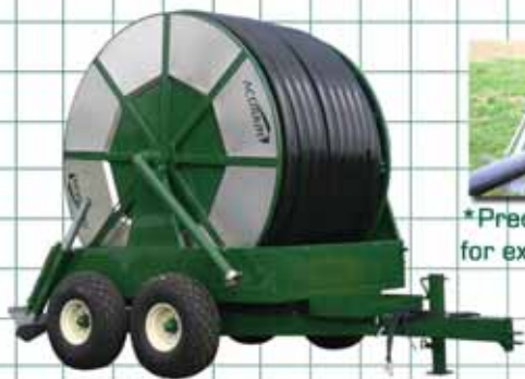
Acurain 4.5" Hard Hose Reel