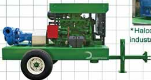
Custom Diesel Drive Units

*35' spray boom with dual adjustable splash plates