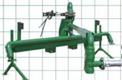
Custom Splash Tool Bar

*Precise nylon guide for exact hose roll up