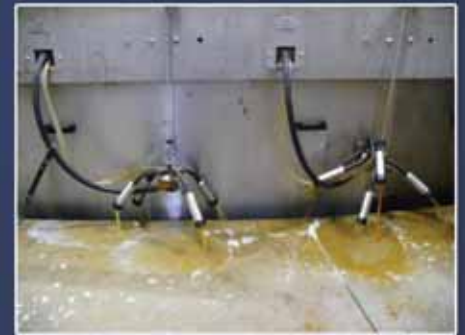
Backflush in Process