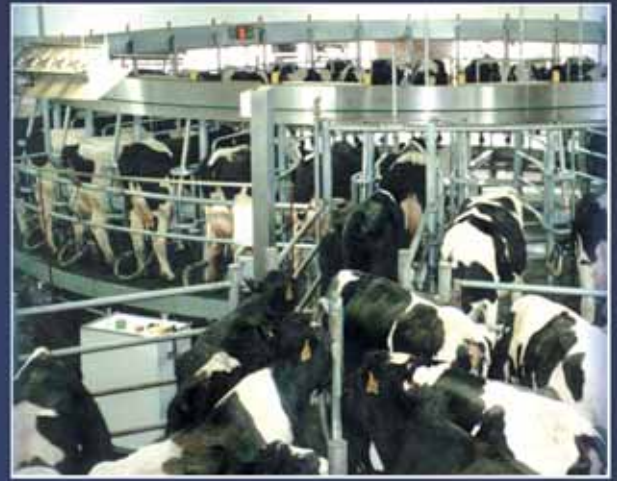
Rotary Parlor with Westwaard Backflush

Westwaard's Rotary BacTrol system is the most complete and efficient system on the market today. So if udder health is a main concern for your dairy, then Rotary BacTrol by Westwaard is for you!