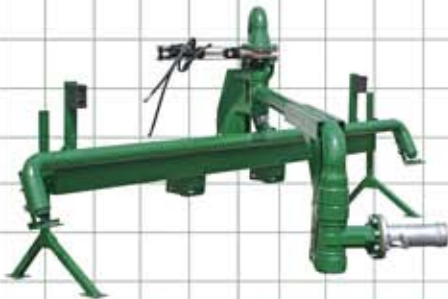
Custom Splash Tool Bar

*Precise nylon guide for exact hose roll up