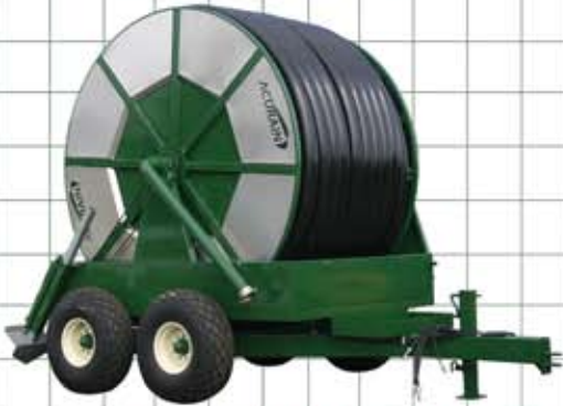
Acurain 4.5" Hard Hose Reel