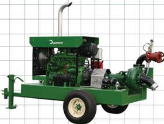
Custom Diesel Drive Units

*35' spray boom with dual adjustable splash plates