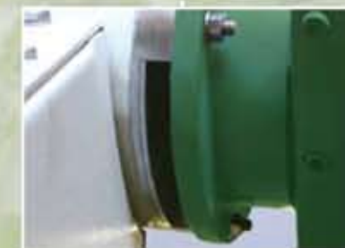
True separation between housing and gearbox Eliminates the risk of expensive maintenance costs by preventing manure from leaking into the gearbox.