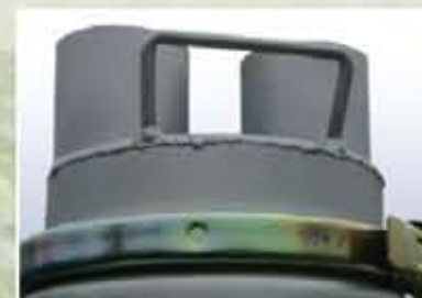
Quick Detach Inlet Quick coupled for ease of inspection and building of solid plug.