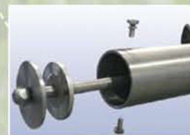
Easy to Assemble It's a snap to disassemble and reassemble the EYS separator.