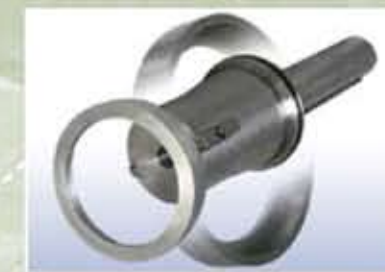
Replaceable Wear-Ring This easy to replace seal reduces maintenance costs.