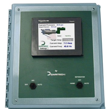
PLC smart press control: Monitors and controls motor load to optimize separation.