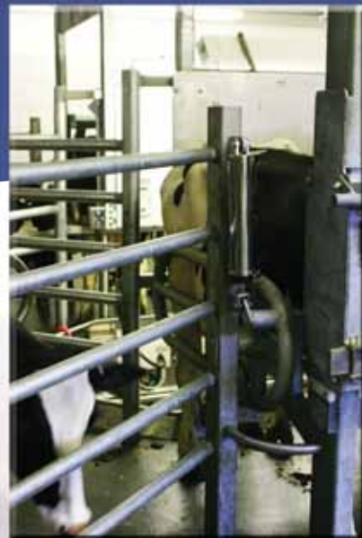
Pivoting entry gate leaves maximum exit space