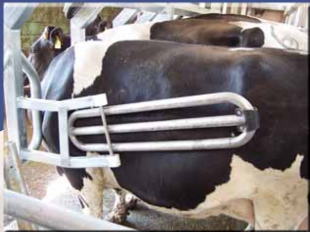
Sequence gates lift with head section